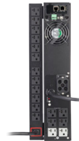
Side mounting Flex PDU with Tower UPS