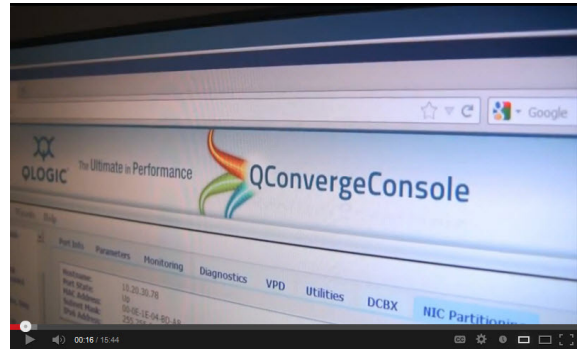
Click on the Image to Watch a YouTube Video

Related Video: QLogic KnowHow: QConvergeConsole GUI: Getting Started