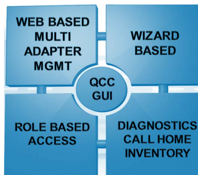
Figure 1: Key Features of the QCC GUI

The QCC GUI unified adapter management tool can be deployed on a management workstation or virtual machine (VM). It communicates with management agents residing on servers with QLogic adapters over a secure channel via HTTPS. Access to QCC is available via any of the supported browsers by pointing the browser to the IP address of the management workstation or VM where QCC is installed. The management agents can be installed on servers with QLogic adapters using SI in Windows and Linux environments.