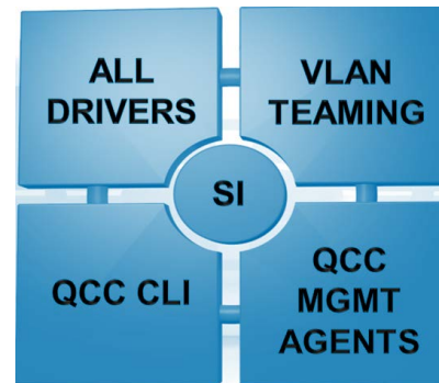
Figure 3: Components of SuperInstaller (SI)